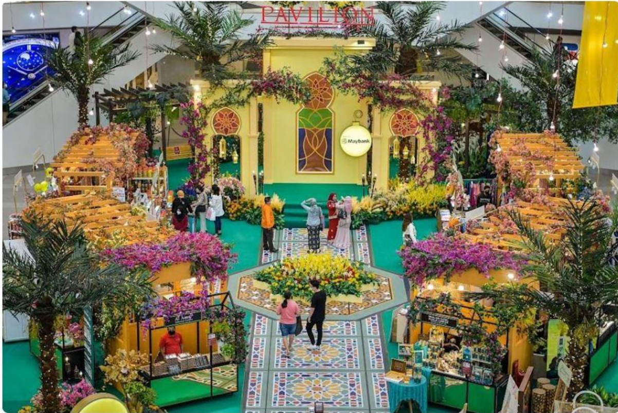
Shoppers can also check out unique products by Malaysian entrepreneurs at the centre court.

Pavillion KL has decked out its centre court in a bright splash of green and yellow to welcome Hari Raya 2021.