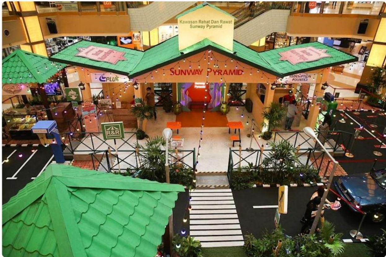
Relive your road trip memories with Sunway Pyramid's rest station.

Anyone who's gone on a road trip would be familiar with the sight of a rest stop (R&R) where motorists can refuel and relax.