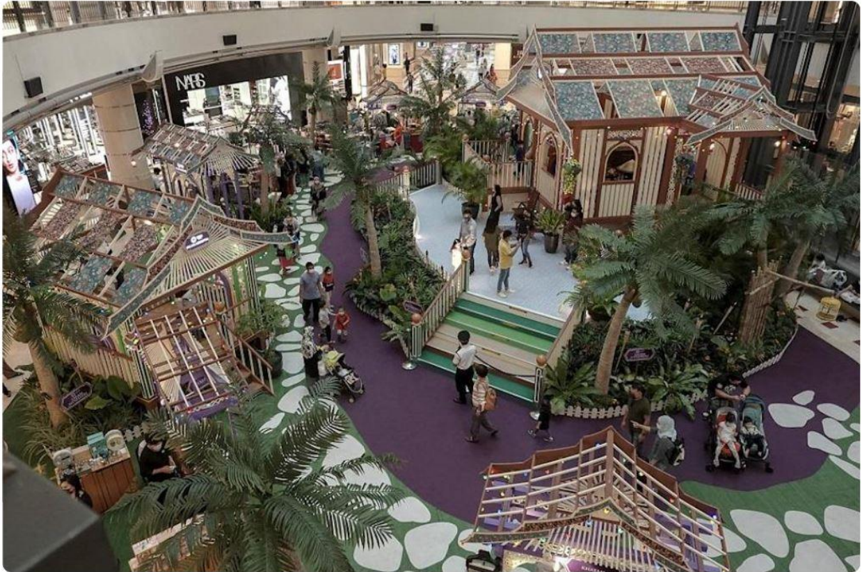
Don't miss the central house and its vintage interior.

Traditional wooden houses have popped up in Suria KLCC's centre court to recreate the scene of a charming kampung .