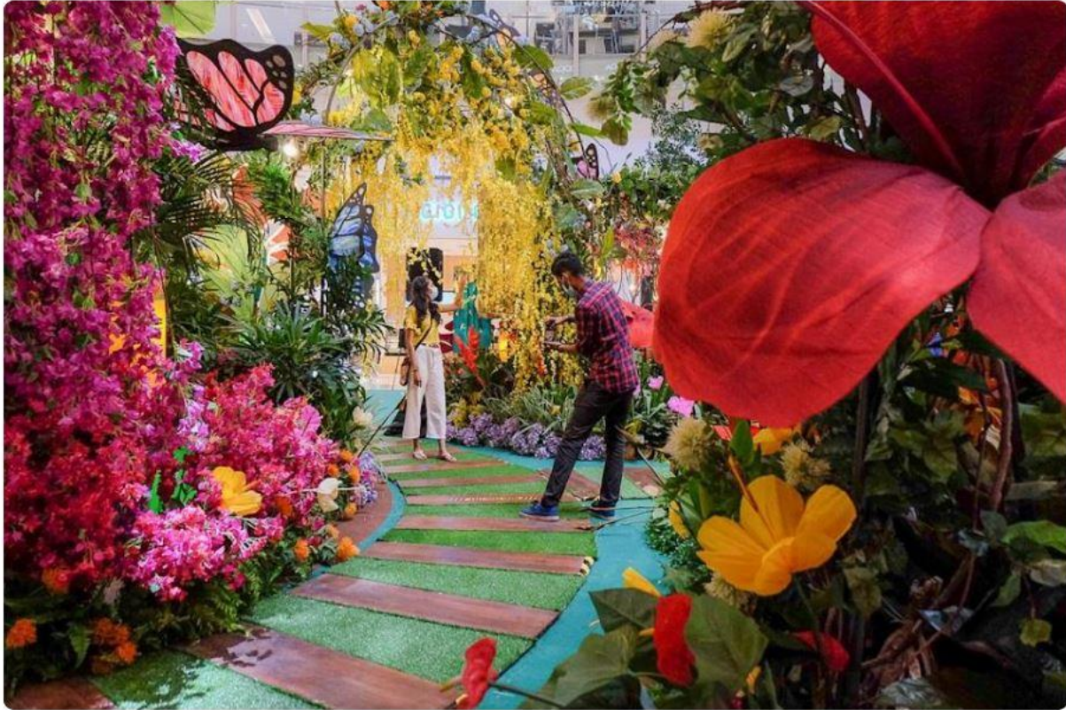
The mall has been transformed into an indoor garden for Hari Raya.

NU Sentral has set up a blooming display of flora and fauna to usher in the festive season. Colourful hibiscuses and butterflies adorned with lights have turned the shopping mall into a green paradise that's perfect for Instagrammers.