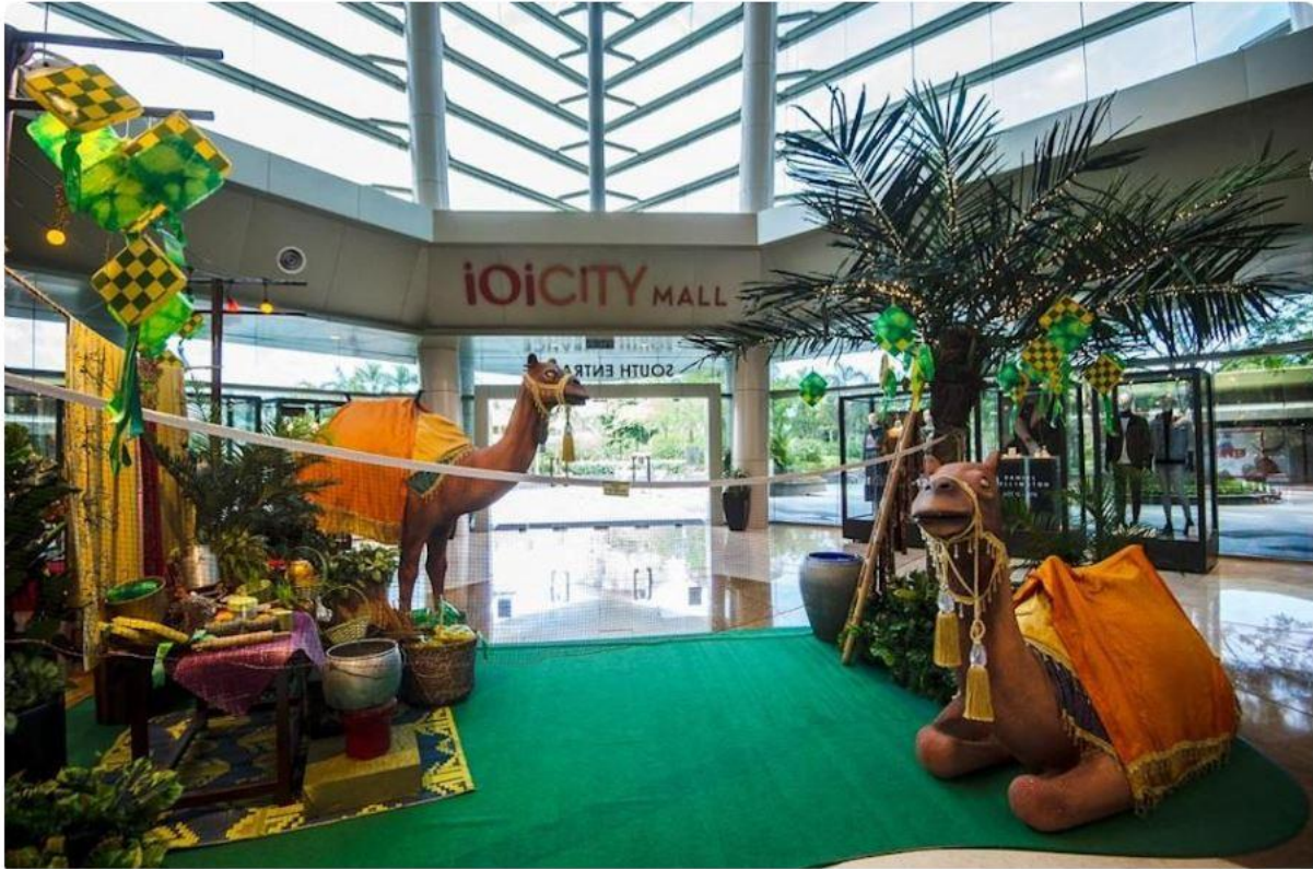
The camels give an exotic twist to the mall's decorations.

IOI City Mall has injected a bit of foreign flair into their Hari Raya celebrations this year. Desert-inspired aesthetics and decorative camels greet visitors at its south entrance, giving a fresh spin to the kampung -themed designs that most malls typically go for.